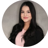
Paola C. Education Profile